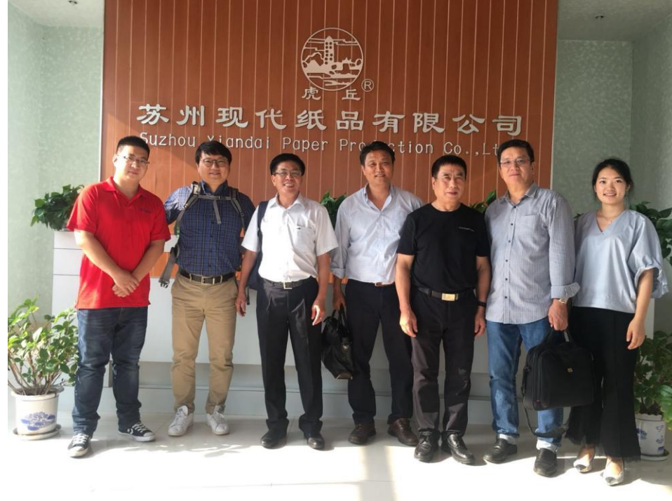
Customers visit our factory