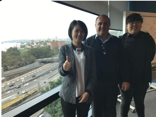
In Australia Client' s office