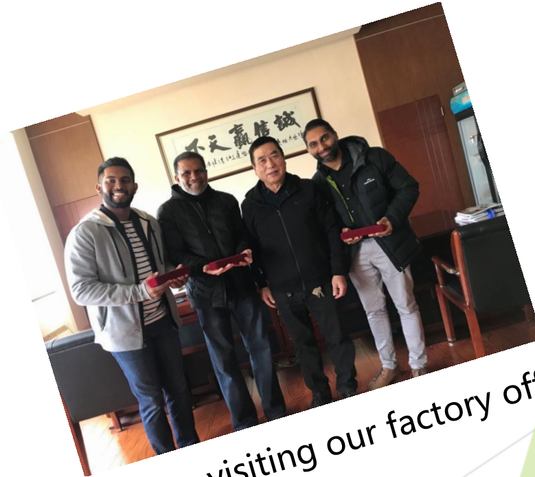
Clients visiting our factory office