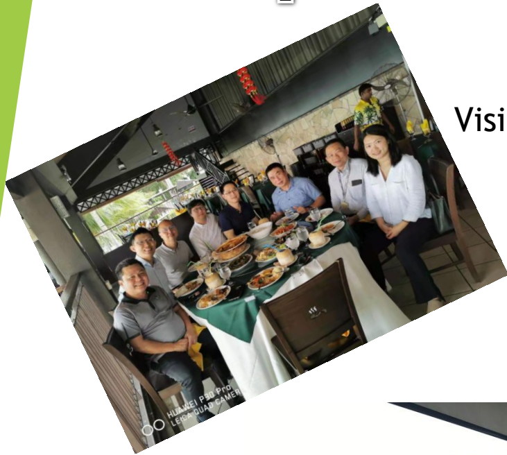
Visiting our client in Singapore